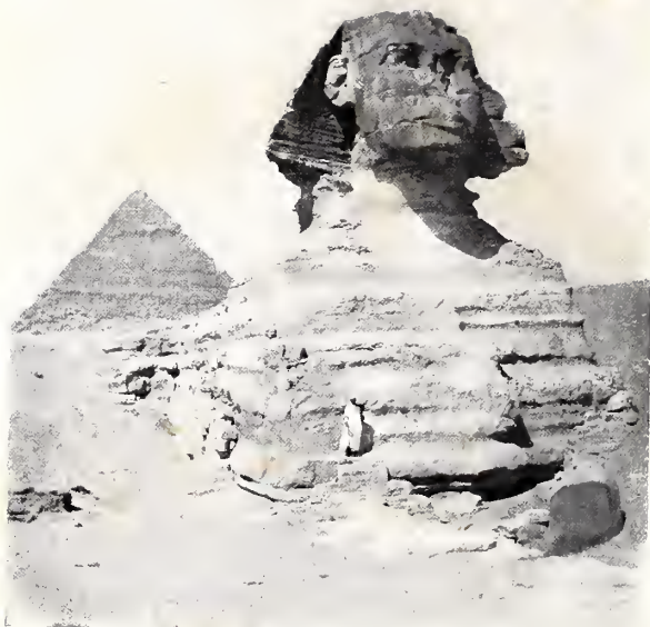
THE SPHINX AND THE PYRAMID