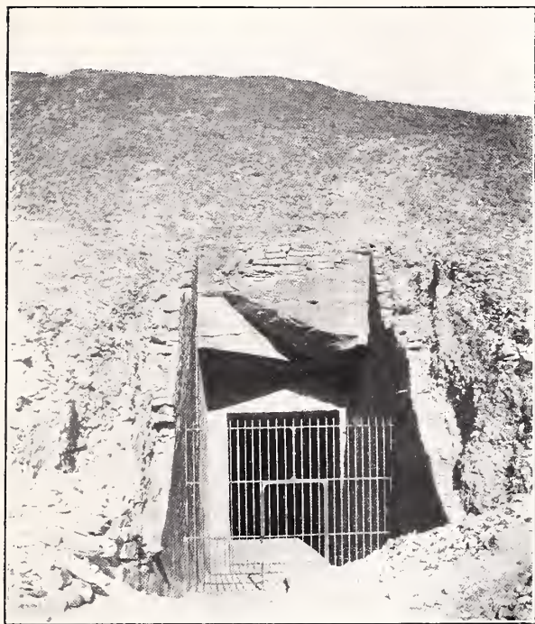
ENTRANCE TO THE TOMB OF SETI I., THEBES-NECROPOLIS