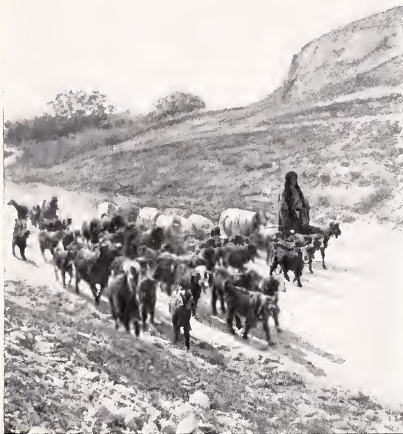
A GOAT HERD NEAR NAZARETH