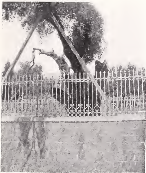
THE OAK OF MAMRE ABRAHAM'S OAK