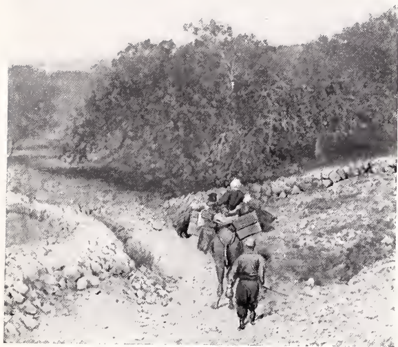
A FAMILY CARRYALL NEAR DOTHAN