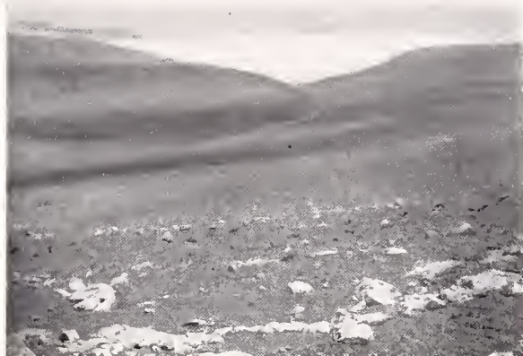
FIRST VIEW OF THE SEA OF GALILEE