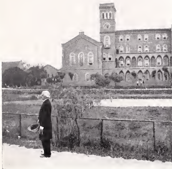
PRESIDENT BLISS OF THE SYRIAN PROTESTANT COLLEGE, BEIRÛT