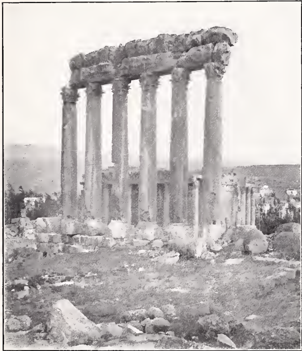
THE TEMPLE OF THE SUN, BAALBEC