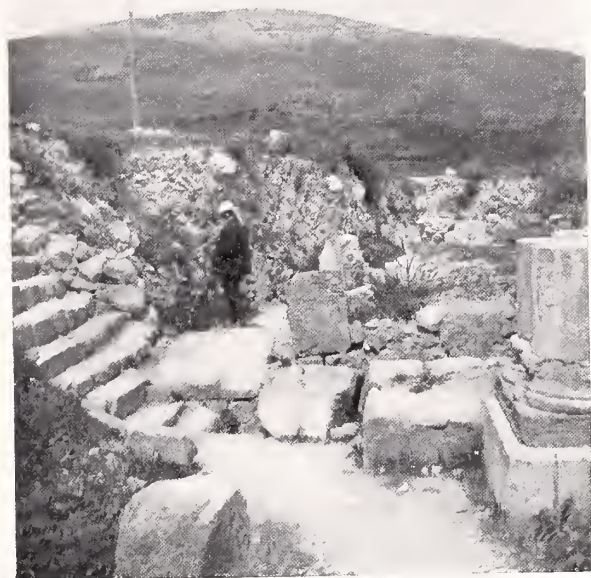
RUINS OVER JACOB'S WELL NEAR SHECHEM