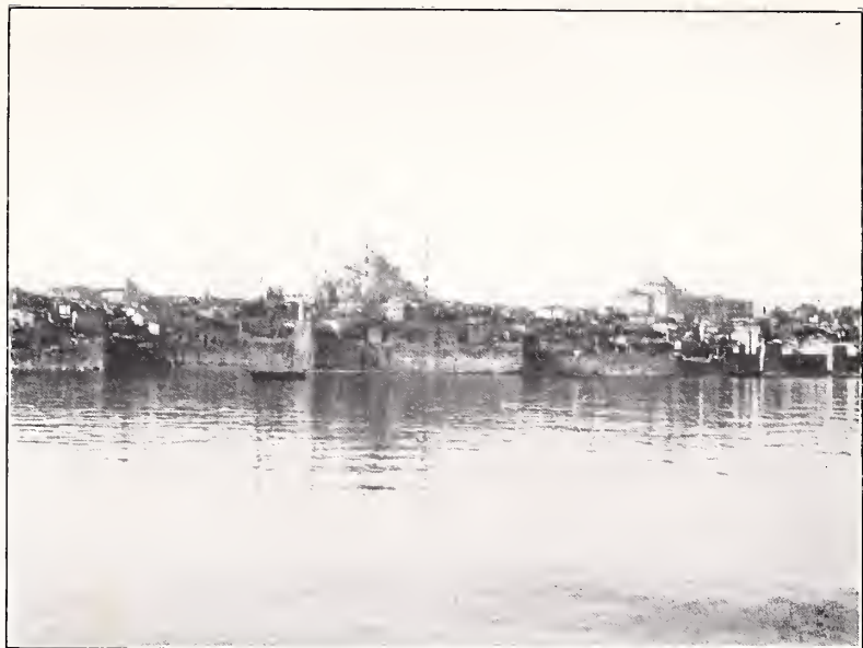
CONSTANTINOPLE FROM THE STEAMER