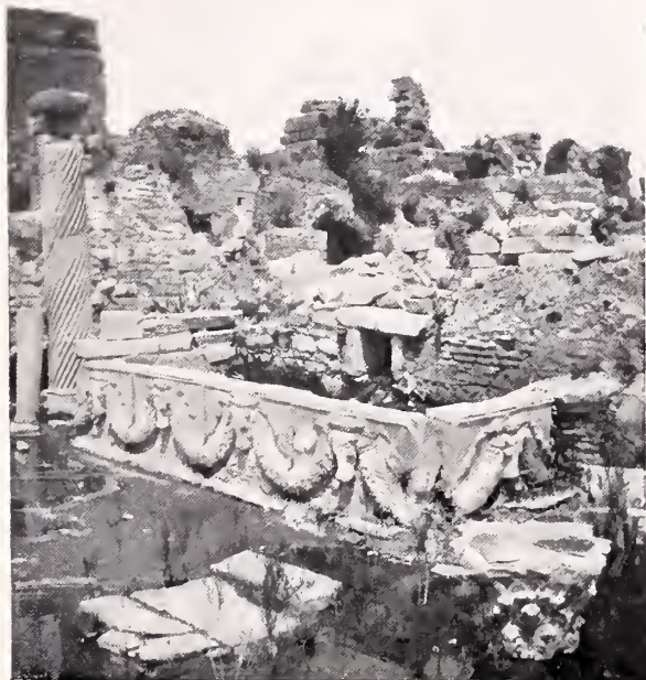
BULL'S HEAD BATH, OR FOUNTAIN AT EPHEBUS