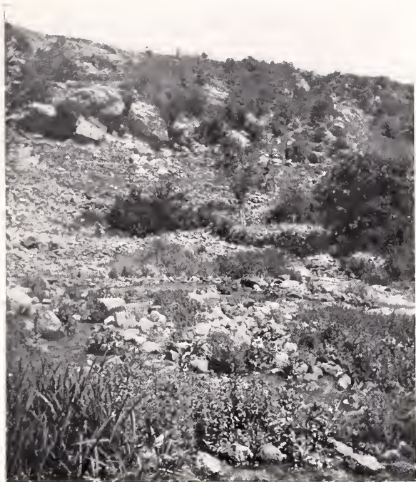
GROTTO OF PAN, ONE OF THE SOURCES OF THE JORDAN