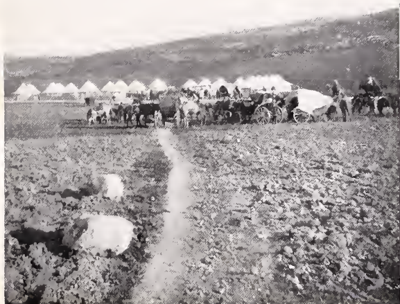
THE FIRST CAMP BETWEEN JOPPA AND JERUSALEM