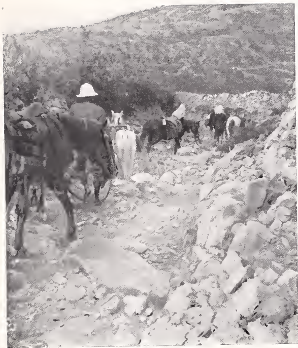
THE DAMASCUS ROAD OUT OF JERUSALEM NEAR BETHEL