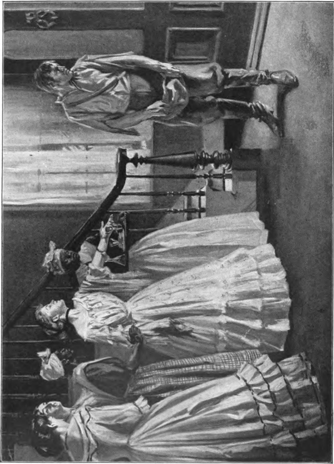
"No! not under this roof—nor in sight of these things "