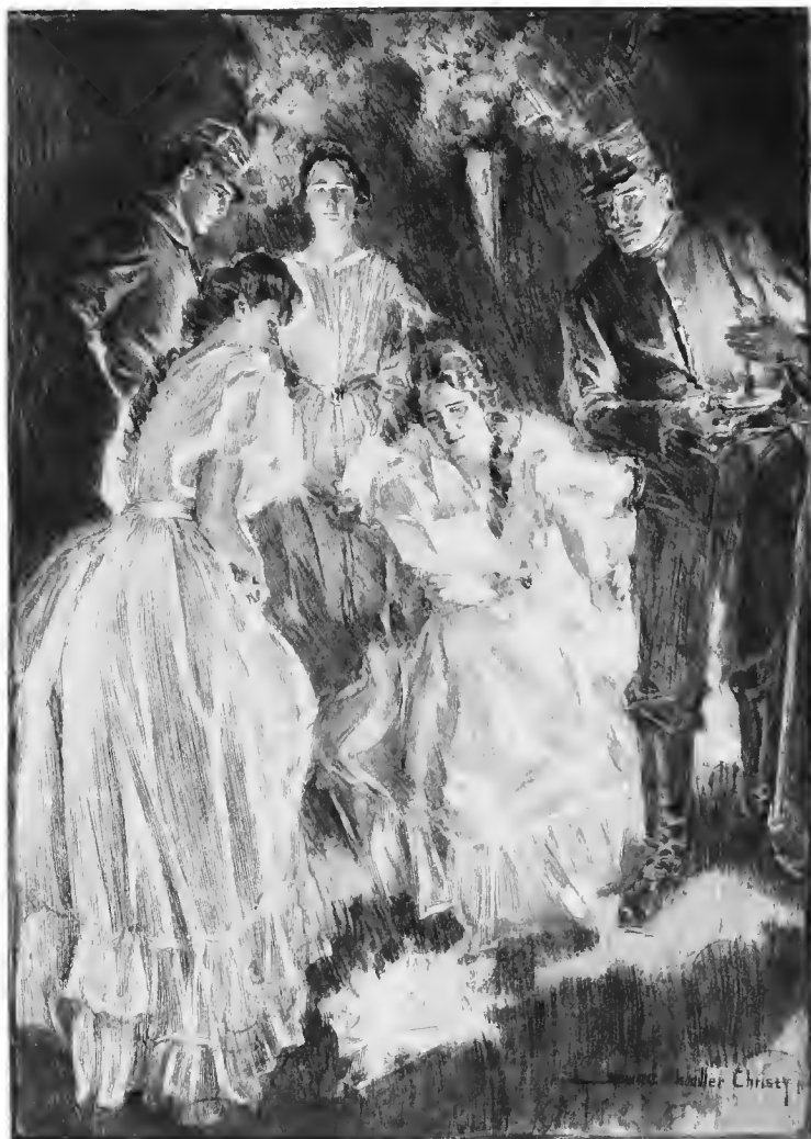
Springing to the ground between our two candles, she bent over the open page.