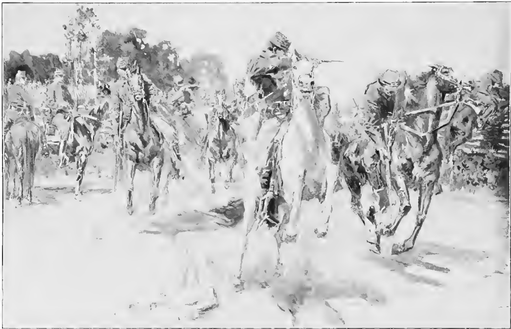
With the rein dangling under the bits he went over the fence like a deer.