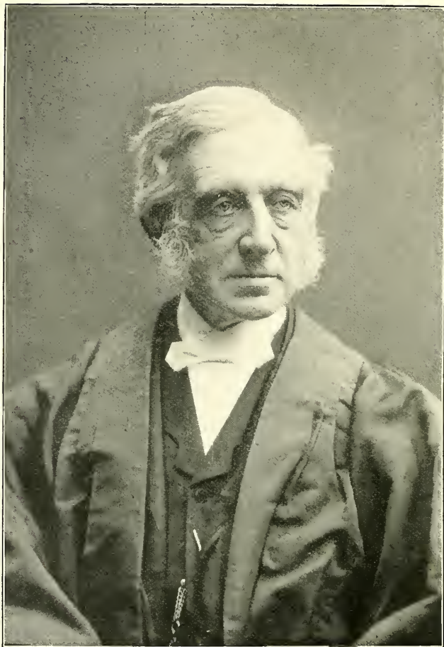
THEODORE LEDYARD CUYLER.