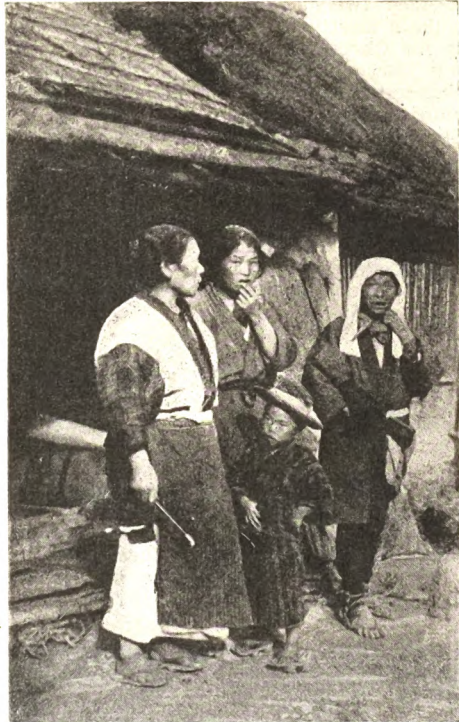
There are forty million of these country people without Christ. Rural Japan calls for Christian workers.