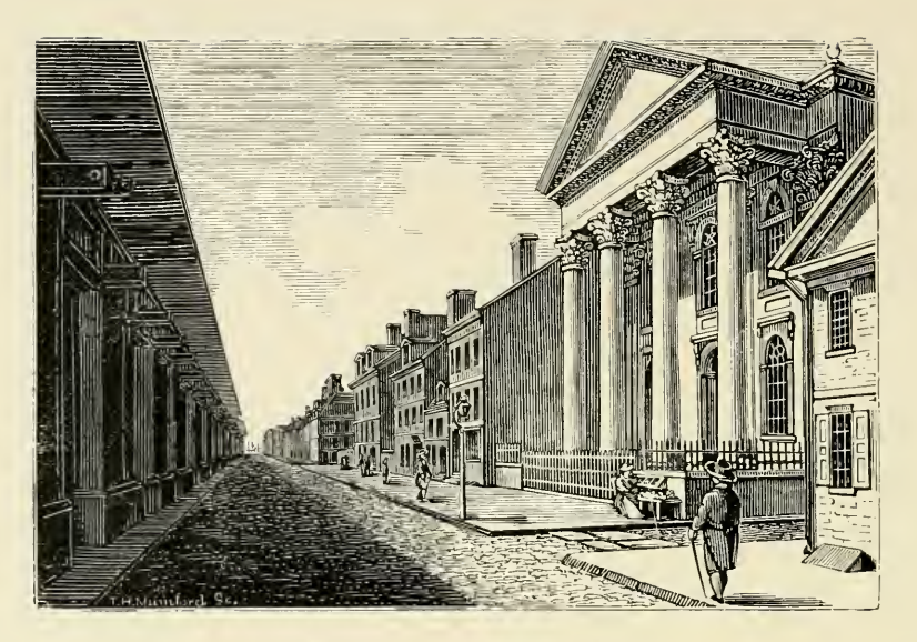
THE MARKET STREET CHURCH OF 1794.