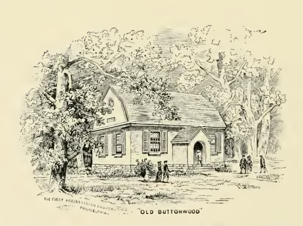
ERECTED IN 1704 ON THE SOUTH SIDE OF MARKET STREET, CORNER OF WHITE HORSE ALLEY, NOW BANK STREET. IT WAS REBUILT IN 1794.