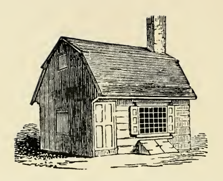
THE BARBADOES STORE, IN WHICH THE FIRST PRESBYTERIAN CHURCH FIRST MET, 1698.