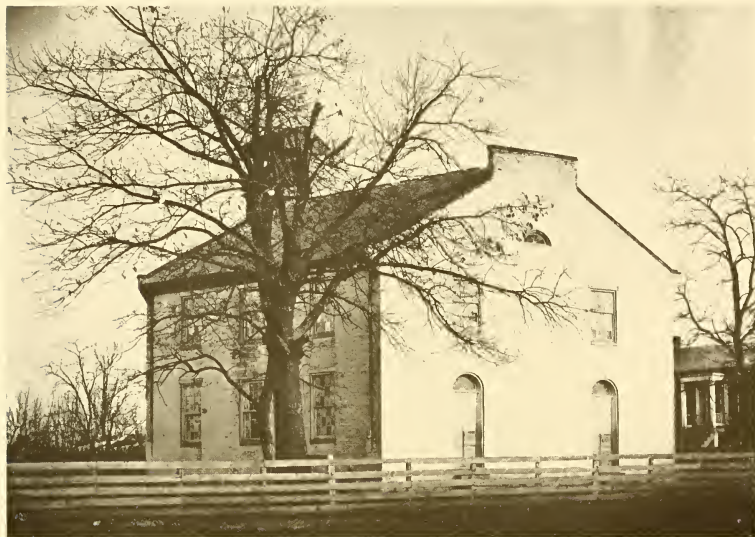
PRESBYTERIAN CHURCH, ST. CHARLES, MISSOURI Built about 1819