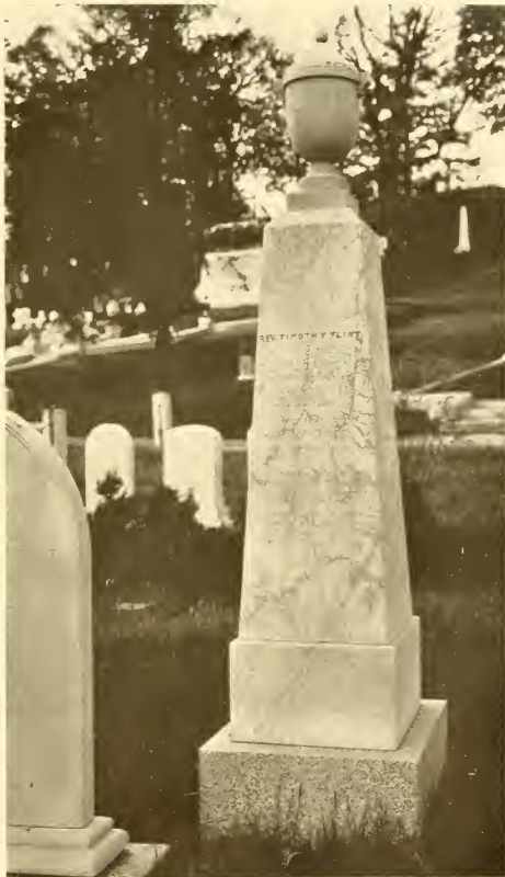
TIMOTHY FLINT'S MONUMENT, HARMONY GROVE CEMETERY, SALEM, MASSACHUSETTS