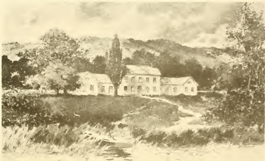
HOME OF GENERAL HARRISON, NORTH BEND, OHIO From the original oil-painting