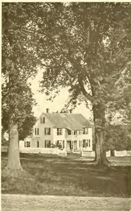
THE PARSONAGE AT LUNENBURG, MASSACHUSETTS Slightly altered in recent years