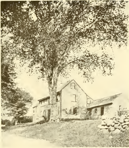
BIRTHPLACE OF TIMOTHY FLINT, NORTH READ- ING, MASSACHUSETTS Burned about 1900