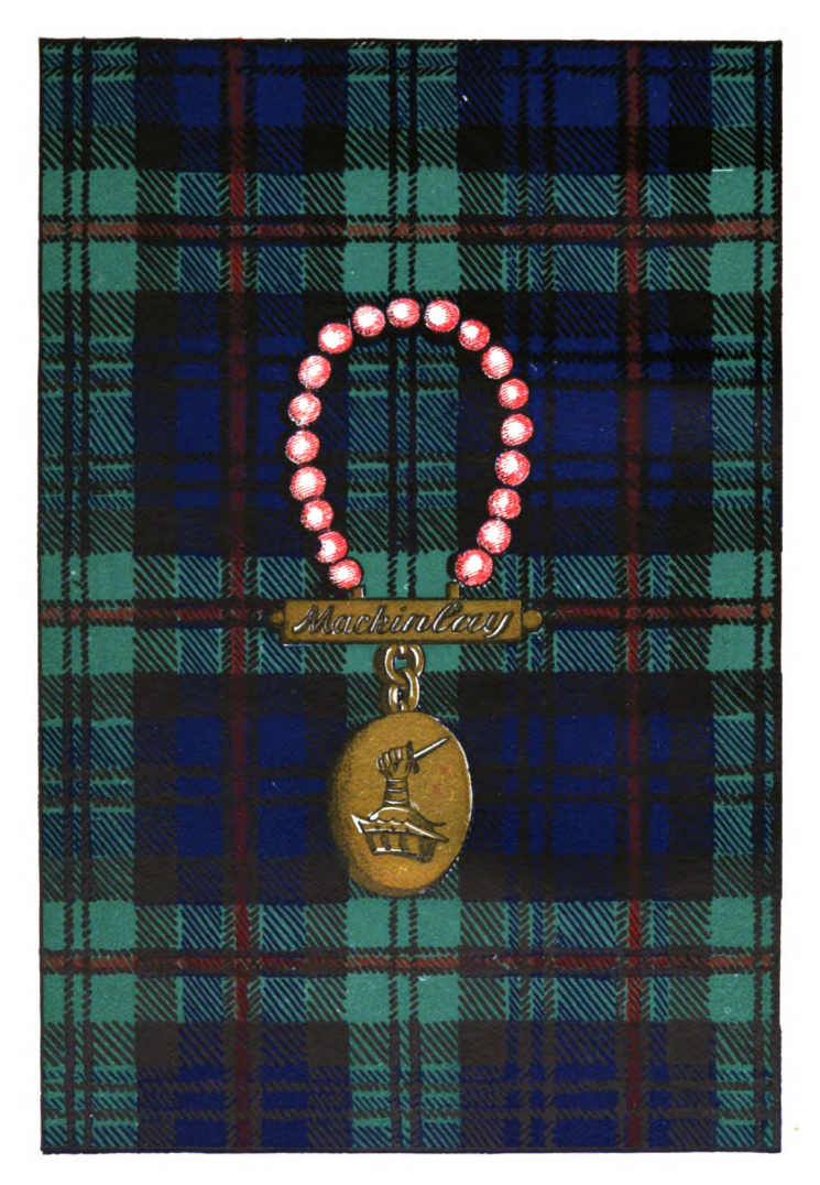
"I knew it by the MacKinloy Tartan." (Page 562.)