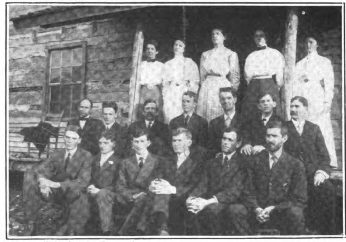
SUNDAY-SCHOOL WORKERS IN THE NORTH CAROLINA MOUNTAINS

In home missionary enterprise the simple life is a thing of the past. Within the memory of the youngest secretary of home missions all missionary effort was frontier or pioneer work. It was the organizing and building of new churches in new communities to accommodate the shifting centers of population. Now the frontier shifts to our crowded cities or disintegrating rural