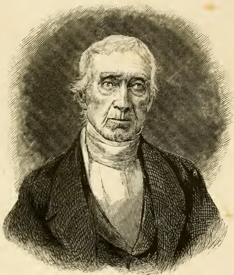
THE PASTOR, Taken at the age of ninety-seven