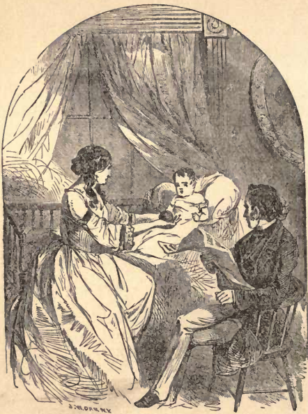
FRONTISPIECE. SUSY'S SIX SERVANTS.